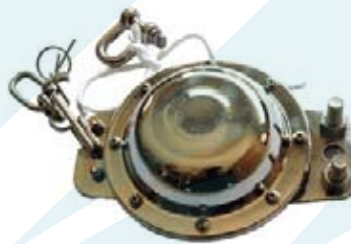
Hydrostatic Release Unit for Liferaft