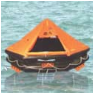
Inflatable Liferaft With SOLAS Emergency PACK "A" Latest SOLAS 96 / LSA Code Certified Capacity: 6, 10, 15, 20 & 25 Persons