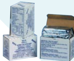
Emergency Food Ration SOLAS / BV / USCG APPROVED