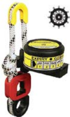
Hydrostatic Release Unit for Liferaft Mode: HAMMER H20