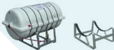
Deck Cradle for Liferaft - Delivered complete with Lashing - Cradles are available for all size liferaft