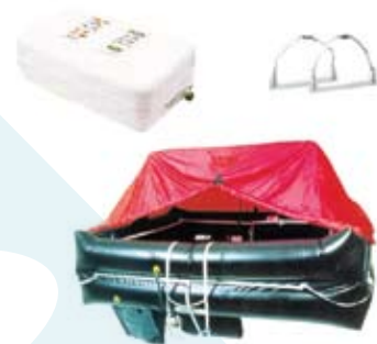
Inflatable Liferaft Non SOLAS, Rigid Container Capacity : 4, 6, & 8 Persons