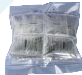
Emergency Drinking Water SOLAS / BV / USCG APPROVED

For further inquiries : technomarine@eim.ae , Fax: +971 6 5354 544, Tel: +971 6 5354 777