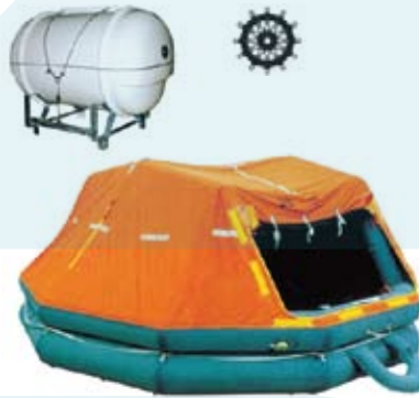
Inflatable Liferaft SOLAS L.S.A. Code, 96/98 EC Med Approved Capacity: 6, 10, 15, 20 & 25 persons