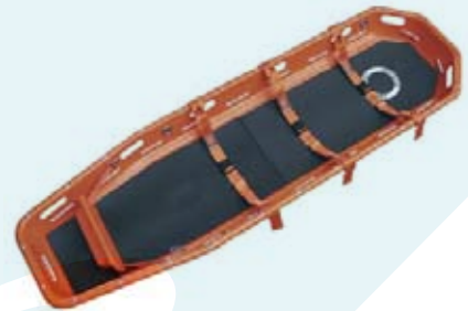
Basket type stretcher