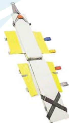
Paraguard type stretcher

For further inquiries : technomarine@eim.ae , Fax: +971 6 5354 544, Tel: +971 6 5354 777