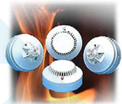
Smoke Detector for Fire

For further security in ship's cargo holds, a smoke sampling system can be combined with the CO2 system.