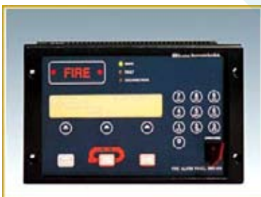
Fire Alarm Pannel