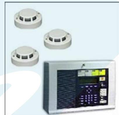
Smoke Detection System for Fire

Foam system for the protection of chemical and oil tank decks or heli-decks in accordance with SOLAS requirements and IBC code. calculated and designed in accordance with international regulations.